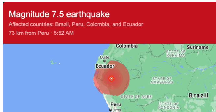
Figure 1 - Google's Map search

An earthquake of magnitude 7.5 (112km depth) occurred this Sunday, November 28 th at 10:52:13 (UTC), at about 42.6 km from Barranca, Loreto, Peru also near Ecuador's border. Most of the damage is in several municipalities in the Amazonas region in northern Peru, close to the epicenter of the earthquake, located 98 kilometers east of the town of Santa María de Nieva, where the earthquake was felt with a very strong intensity. 1